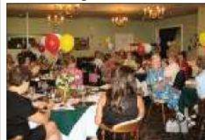
We had great attendance, including new guests to welcome.