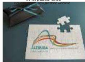
The puzzle results... now an invite for potential Altrusans!